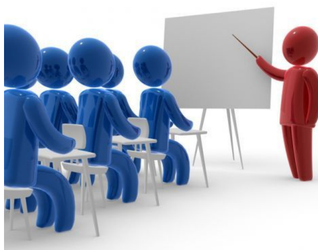
Figure 2: Internal staff capacity development

During the period under review the following capacity development opportunities (in Figure 2) were made available to staff of the organisation.