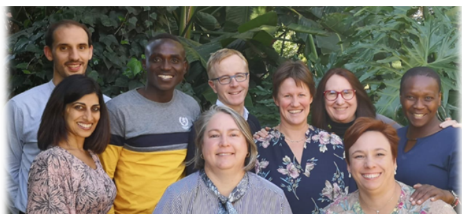
Our Executive Director participating in an in-person Advisory Group meeting with the AEN

Due to recognition of our role within the policy-making space in Ghana, we received invitation from government agencies to join discussions in various events that explored opportunities to improve use of evidence in decision making.