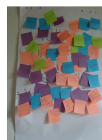
Samples of learning aids used in training sessions depicting subject of discussion