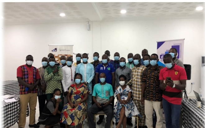
Group photograph at a training workshop organized by CDD Ghana under the E4D project

The Ghana Centre for Democratic Development (CDD) invited PACKS Africa to serve as implementing partners on the above mentioned project which aims to build capacity of policy officers at sub-national level for their enhanced evidence use in policy processes.