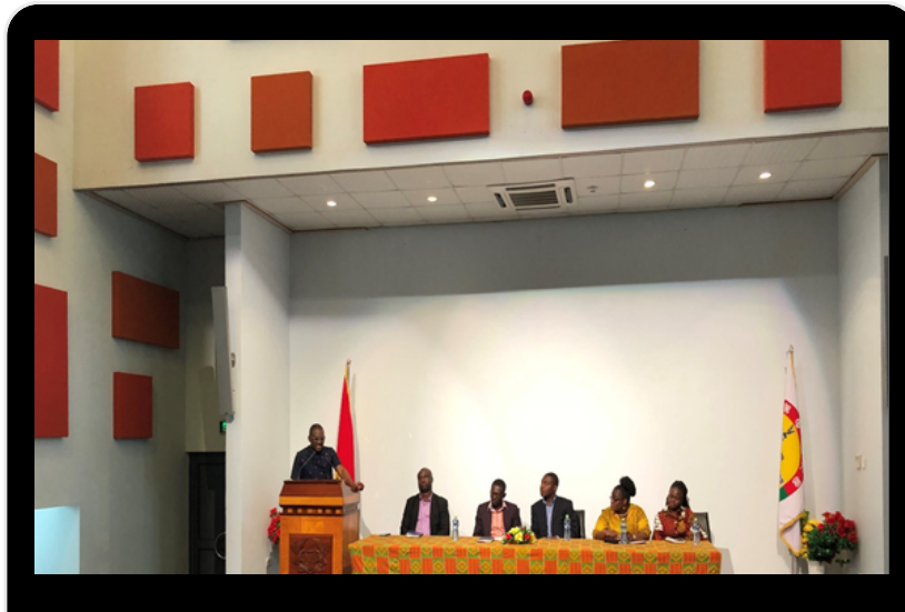
A panel discussing evidence use during celebration of Africa Evidence Week (2019)